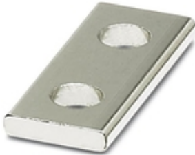
Connection element, length: 91.3 mm, width: 42.8 mm, height: 11.4 mm, number of positions: 2, color: silver

Please be informed that the data shown in this PDF Document is generated from our Online Catalog. Please find the complete data in the user's documentation. Our General Terms of Use for Downloads are valid ( http://phoenixcontact.com/download )